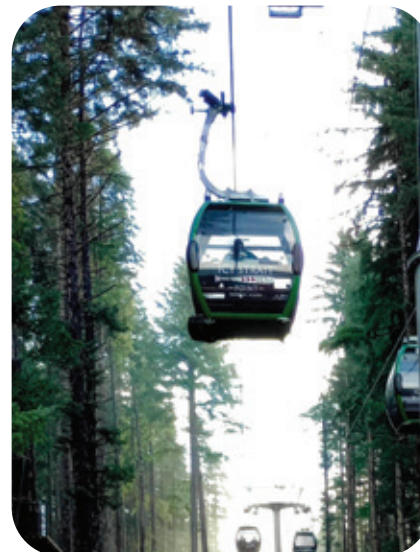
KORBEN SPEEGLE SKYWAY TRAM