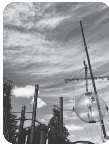
MARIA GIANELLI-VRABEL, S230 STEEL FACTORY STACKS