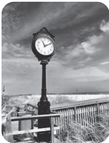
SUSAN BARTOS, S202 CLOCK