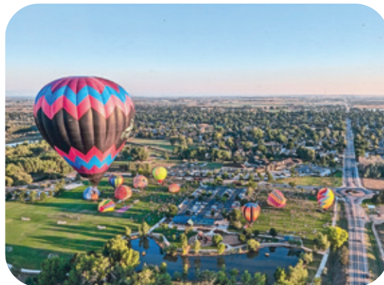
LORI PROMENSCHENKEL, S053 HOT AIR BALLOONS