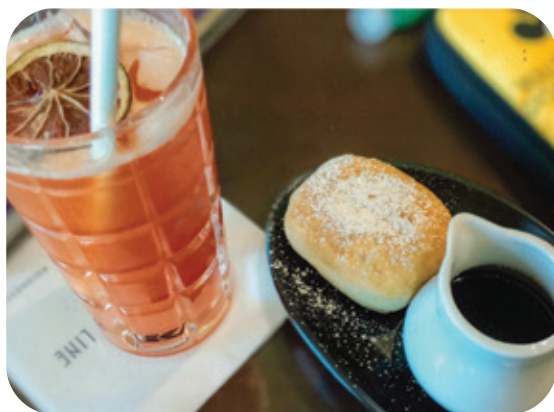
MELISSA SPEEGLE, S161 BEIGNET AND DRINK