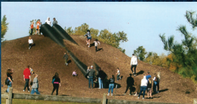
Taking the walk to the top to slide down in style!