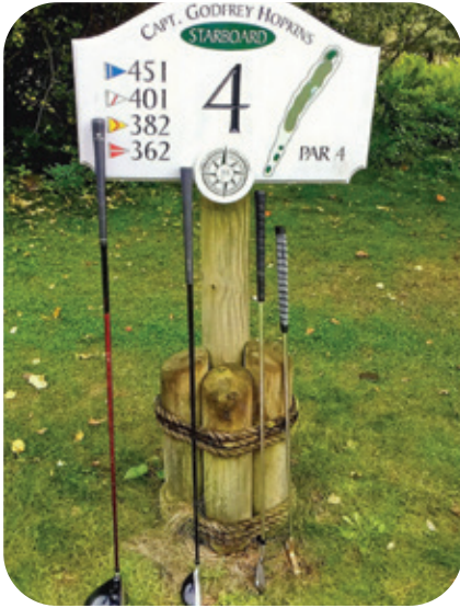
VITO DELLIBOVI, S035 GOLF FOUR