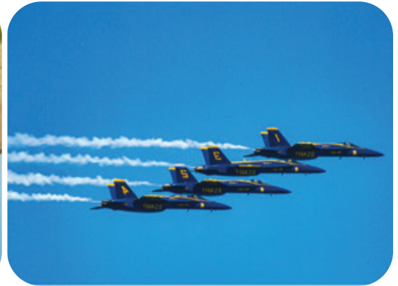
AMANDA BONCHIK, S452 BLUE ANGELS