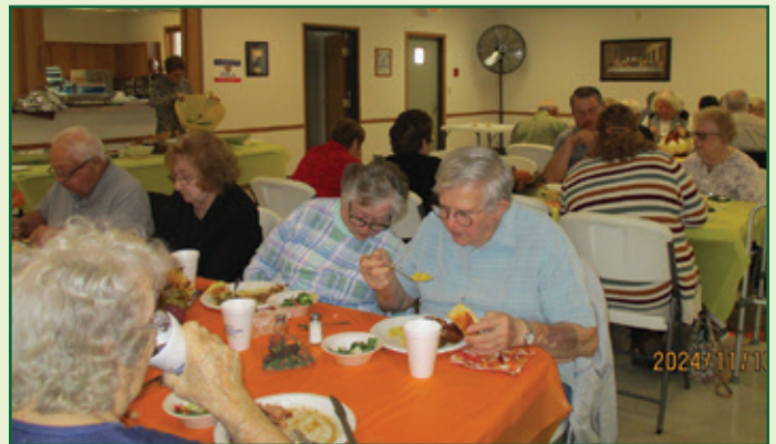
W16 members enjoying the 7th annual dinner meeting