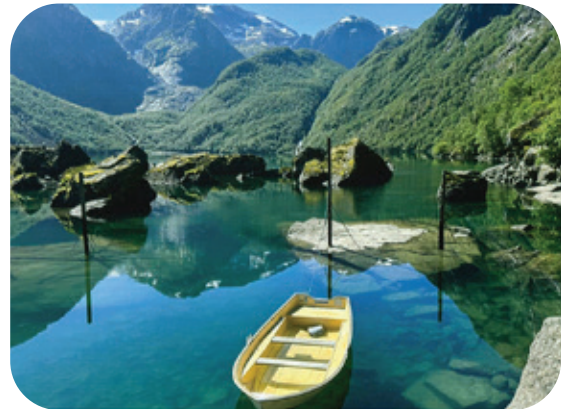
MARY ANDREANO, S009 BOAT IN WATER