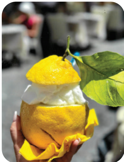
AVA KNAPP, J115 LEMON SORBET