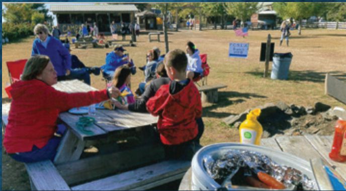
Enjoying a traditional picnic lunch of hot dogs without a fire pit.