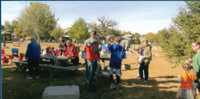
Preparing seating for lunch and finishing up conversations with Branch members.