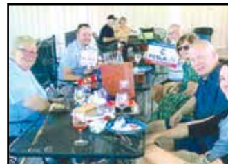
Two generations of the Bilek/Popelka family enjoy their time together.