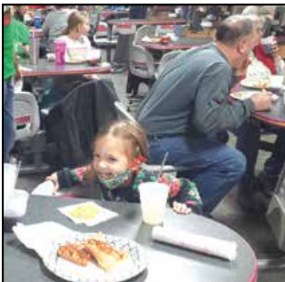
Members enjoying bowling and pizza.

On Sunday, December 5th, 2021, FCSLA Branch W137 held the Annual Family Christmas Party at Cedar Rapids Bowling Center. Members were treated to bowling, pizza, drinks and snacks. Everyone also received a Christmas gift bag with candy and FCSLA giveaways.