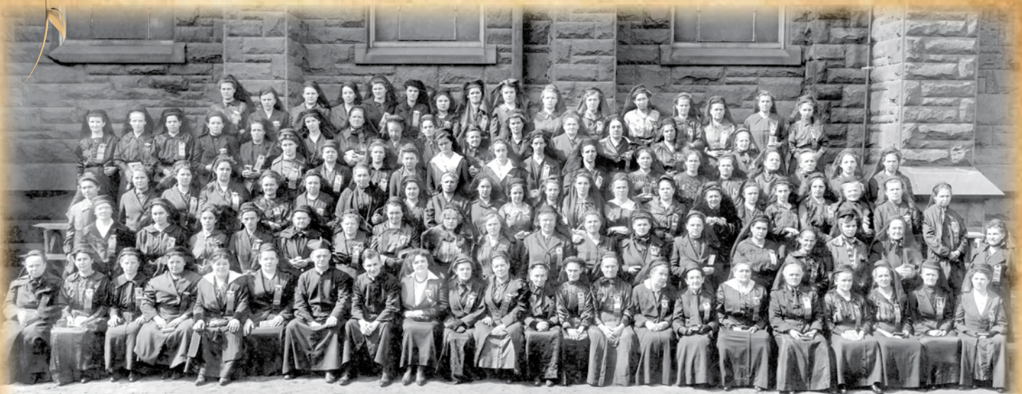
SP. PRE. P. MARIE CIS-12. I. K. S. Z. J. ZALOŽENE SEPT. 17. 1893