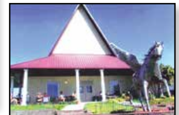
Soaring Wings Vineyard and Brewing.