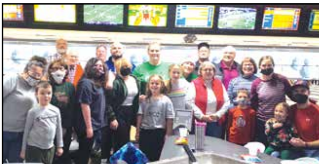
Group photo of attendees.