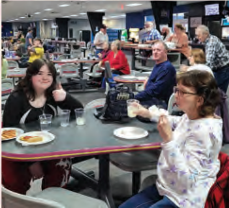
Bowlers took time off to watch others bowl and to eat some pizza.

On Sunday, March 10th, FCSLA Life W137 hosted a Family Bowling and Pizza afternoon at Cedar Rapids Bowling Center. Originally scheduled for January, it was postponed to March due to inclement weather. Members enjoyed bowling, pizza and snacks. Everyone went home with a treat bag.